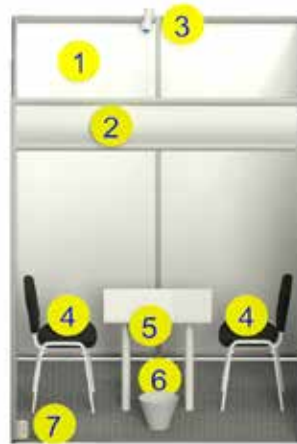
Booth 4 sq. m.

The standard furniture of an exhibition stand is as follows: