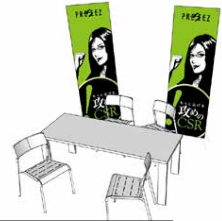
Working place in Kharkiv and Dnipro

The standard furniture of an exhibition stand is as follows: