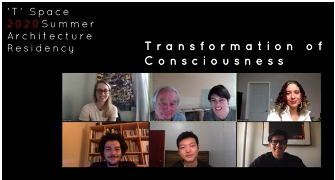
VIDEO: 2020 Residents discussing their works with critics.